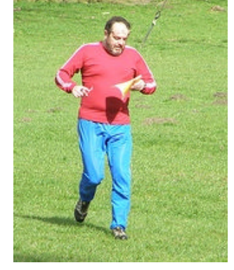
At least this bit's downhill

It seems to me that there is maybe an opportunity to develop on from the Poacher. Having got into the swing of Wednesday evenings, why not continue