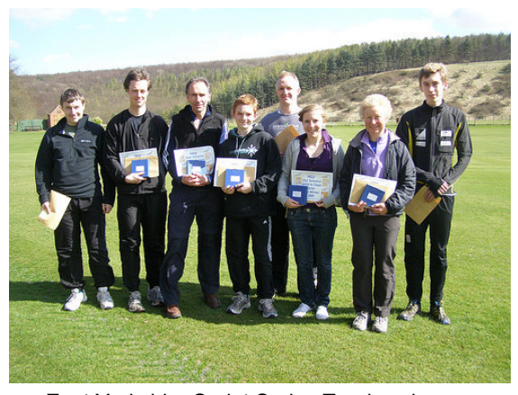
East Yorkshire Sprint Series Trophy winners