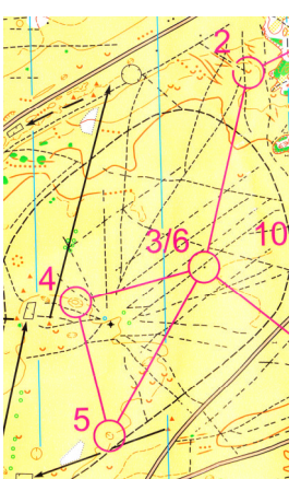
Thinking further ahead, I am sure that butterfly legs are a useful tool for planners particularly in restricted areas. With SI now universally used and local

Another two weeks later, I had my third papillonic encounter, this time in the form of the Lincoln Urban Veteran variety. Unfortunately one of the wings of this butterfly was half missing, a cruel joke by a university student, perhaps? I found this species of butterfly pretty tame and uninspirational, as it was found amongst University Halls of Residence; due to its habitat it was always at risk from attack from foreign bodies and with the ineffective Security Control it spoilt an otherwise well planned course. In retrospect this was not the ideal location to introduce butterfly legs, and it could have been significantly worse if the central control had been stolen, i.e. the one that had to be visited 3 times.