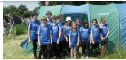
HALO Juniors at YBT Final July 2013

unsubscribe from this list | update subscription preferences